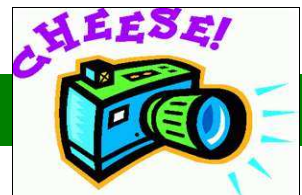
Photo retakes November 9th

After 15 years in schools in schools in Canada and internationally ,the roots of empathy program has shown effects of raising social and emotional competence and increasing empathy in participants, as well as reducing the incidence of aggression and bullying with those who have participated in the program.