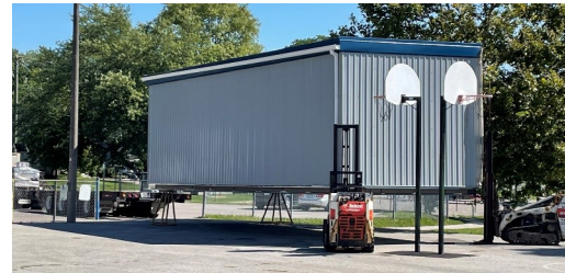
Our Portable Arrives

As part of our safe school policy we ask families to release and pick up their child(ren) at the gates.