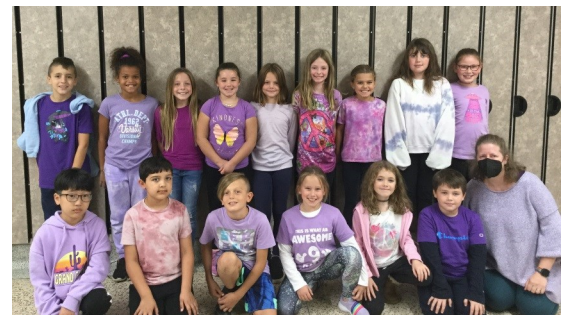
Students wore Purple on Rowan's Law Day