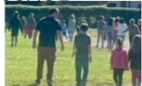
Students and Staff Participating in the Terry Fox

Teachers and students will be working hard setting goals and completing work as they prepare for the Progress Reports which will be going home on